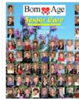
Sonoma County Directory

Born To Age P.O. Box 6863 Napa, CA 94581 707-226-7127 borntoage@hotmail.com