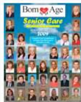
Alameda County Directory

Click on Your County Directory for information on your community and to download your free PDF copy