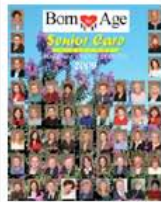
Marin County Directory