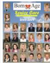
Solano County Directory