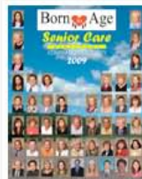
Contra Costa County Directory