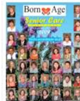
Napa County Directory